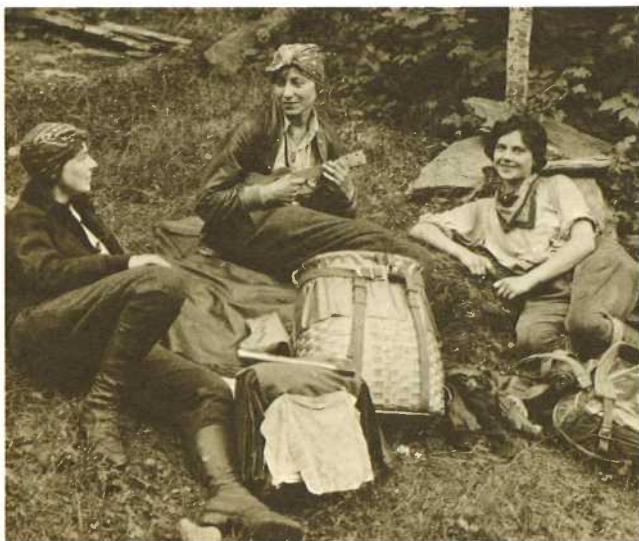
The first three women to hike the Long Trail from beginning to its end. Their hike in 1927 took twenty-seven days.

They decided to end the Long Trail here. The following summer, two University of Vermont students followed the markers set by the Buchanan brothers and cleared the final ten-mile stretch with their axes and hatchets. At last the Long Trail was finished, extending 265 miles from border to border. It had taken twenty years to complete.